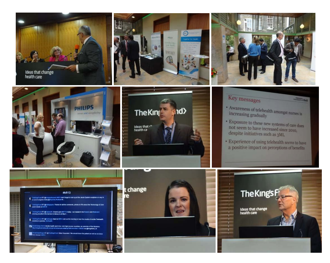
Item 3 - Kent Care in the Digital Age event